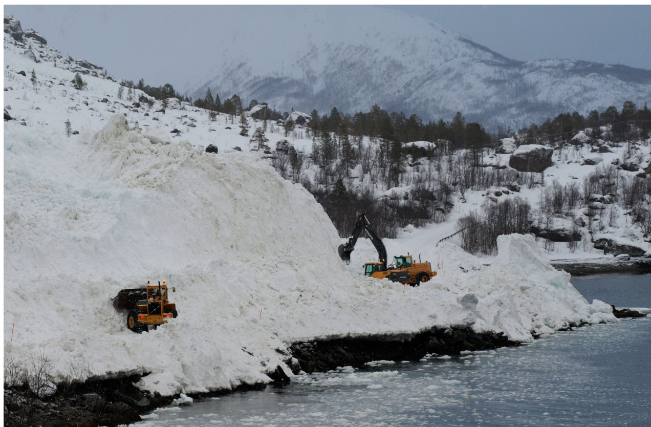
Fig. 2. Snow clearance after an avalanche at Holmbuktura on the seaside road, facing towards Lakselvbukt (Photo: Bjørn Stakkenes, March 2014)

The questionnaire was based on a literature review and contact with persons with detailed knowledge of the study areas. Prior to the final survey design, the research team communicated with a number of inhabitants to ensure that the questions were relevant and understandable. The questionnaire design process and the phrasing of survey items included ethical considerations, as some topics could be a source of anxiety or unwanted self-knowledge (Pidgeon et al. 2008). The respondents were requested to indicate on a five-point Likert-type scale whether they agreed or disagreed with some statements about their experiences related to road closures resulting from avalanche or risk of avalanche during the current winter. They were also asked which consequences listed in the questionnaire the life-line cut-offs possibly had for them, such as whether they adjusted in a special way in relation to lack or possible lack of connectivity due to avalanches and/or adverse weather events. Responses that expressed subjectively important aspects for living in the area were utilised to indicate place attachment. Equally, questions about local relations and trust in local and/or regional authorities and road maintenance staff were used to measure social capital. Moreover, the study elicited common demographic variables such as gender, age,