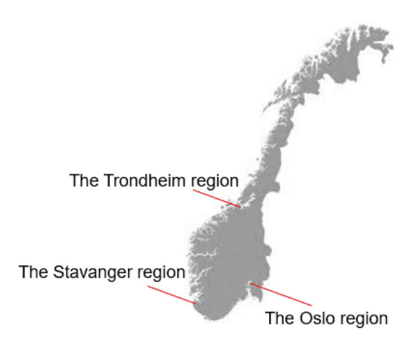
Fig. 2. Locations of the three urban regions.

those indirectly involved or potentially affected. We interviewed politicians, county- and municipal-authority representatives (for the latter both core city and surrounding municipalities), public-transport actors and local business-association representatives. We sought to interview the same types of informants for the three UGA cases; However, due to differences between the urban regions and their governance structures, the number and type of informants were not completely equal. We also interviewed state-level representatives from the national road authority and two ministries. The interviewees were actors holding key positions in establishing and administrating the UGAs and more indirectly involved actors.