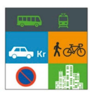
Fig. 1. Three hypothetical packages of measures, illustrating the degree of local flexibility. Explanation; blue - car-usage cost (e.g. toll road), white - car-use regulation (e.g. reduced access to car-parking), grey – public transport facilities, orange – walking and cycling facilities, green – land use regulation (e.g. urban densification). (For interpretation of the references to colour in this figure legend, the reader is referred to the Web version of this article.)