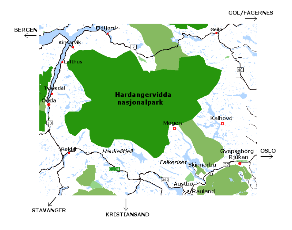
Figure 1. Map of the study area