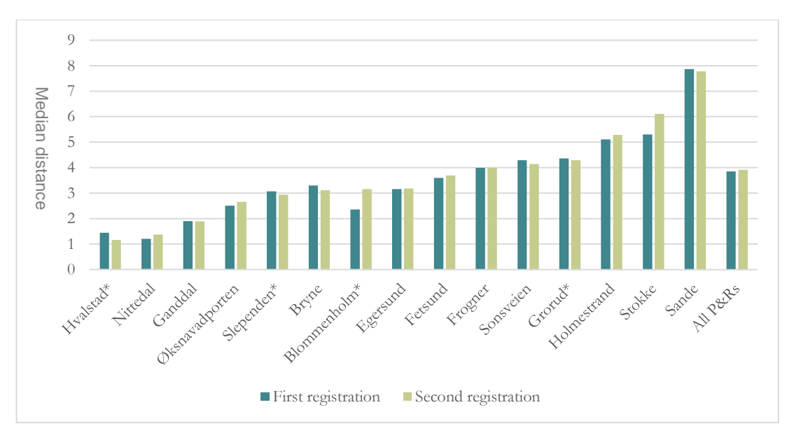
Figure 3. Median distance travelled (in kilometers) from residence to PCR, among users before and after changes in the charging scheme*

Moving on to the second research question, Figure 3 shows the median distance travelled from users' residential location to the P&Rs.