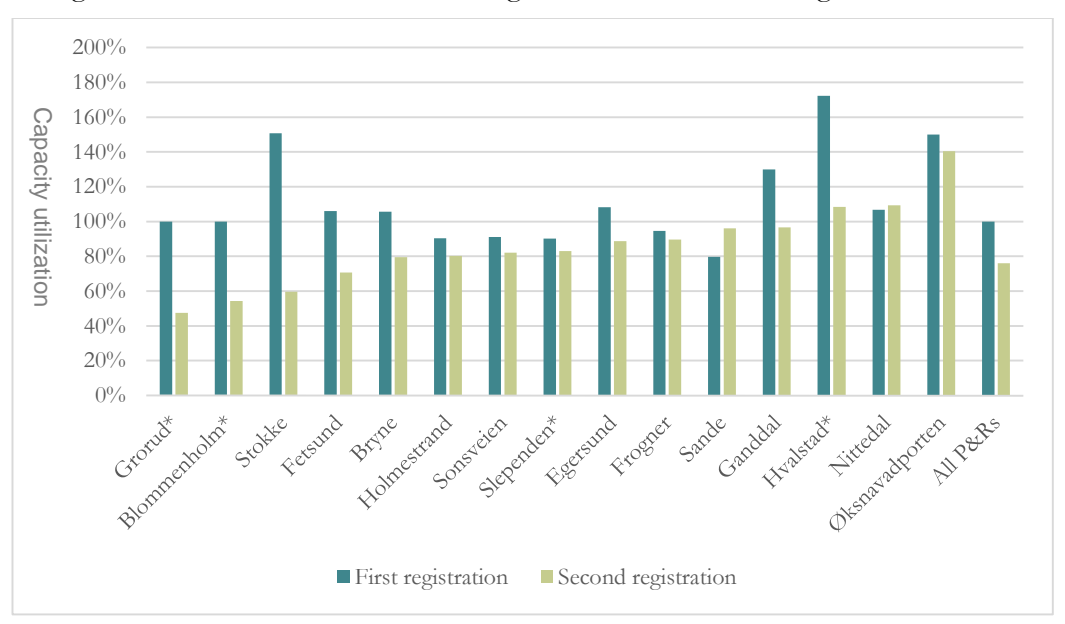
Figure 2. Capacity utilization before and after changes in the charging scheme*. Utilization over 100 percent indicates that the officially registered capacity (in table 1) is inaccurate.

The first research question is answered by investigating how the capacity utilization changes between the first and second registration, as shown in Figure 2.