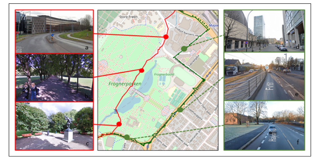
Figure 2. Revealed versus shortest route A-avoidance of a park.

Route A (Figure 2) shows that the shortest path leads through a large public park area and offers green and blue surroundings, as well as non-asphalted roads and pedestrian areas (Figure 2(b) and (c)). The respondent chose instead for a longer route around the park, following asphalted roads, largely with bike lanes (Figure 2 (d) to (f)). A park could have offered visually attractive green and blue environments. On the other hand, uneven road surfaces like gravel roads can contribute to dirty clothes, and heavier and more uncomfortable cycling. Another deterring aspect is that it could be