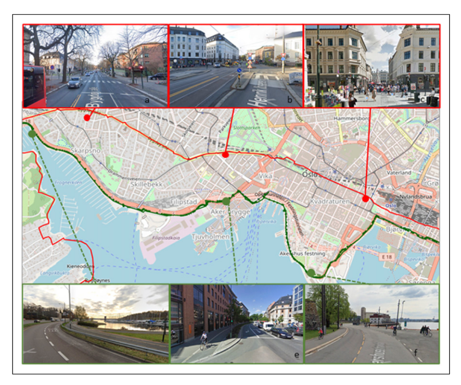
Figure 3. Revealed versus shortest route B—a waterfront detour. Street View from: (Google, 2022)